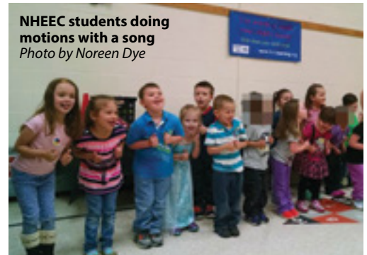
NHEEC students doing motions with a song

Songs can ease your child into tasks like picking up toys or undressing for a bath. You might try making up a chant to the tune of "Here We Go Round the Mulberry Bush." Sing, "Water is filling up the tub, up the tub, up the tub..."