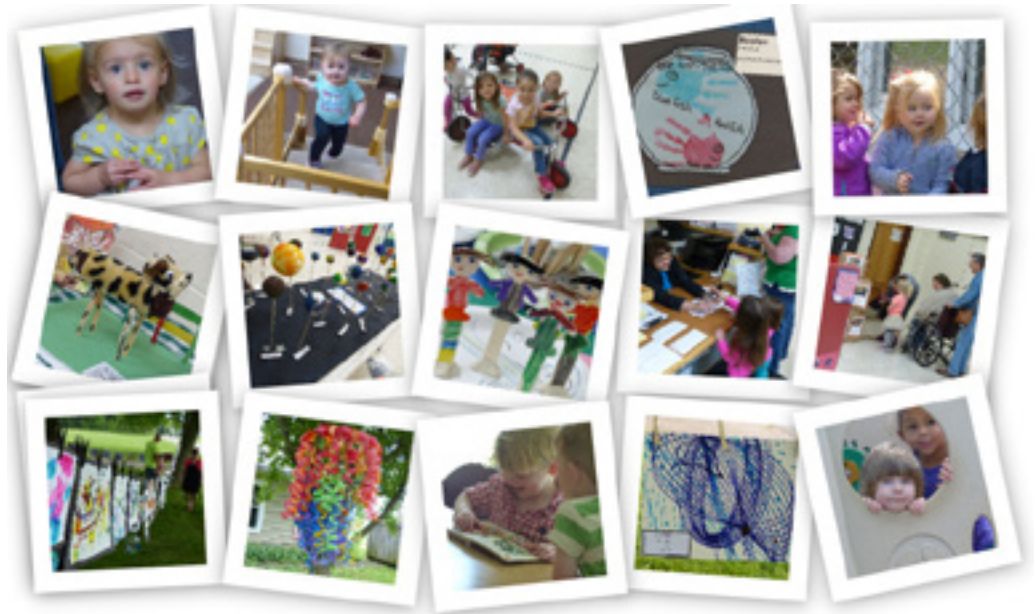
The photos above were captured at NHEEC and GCCC during their art shows and in the classroom. Due to a computer/server error, we don't have recent photos from Fredericktown. Look for more this summer!