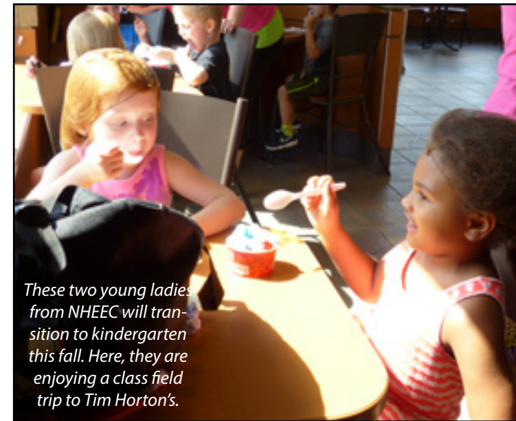
These two young ladies from NHEEC will transition to kindergarten this fall. Here, they are enjoying a class field trip to Tim Horton's.

THANK YOU to all families who took the time to complete our survey. It's very helpful to us in making changes and looking toward the future.